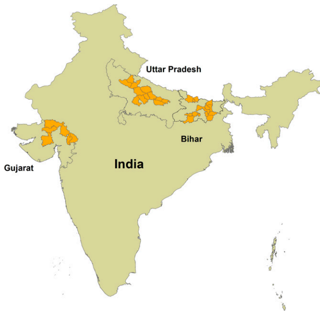
FIGURE 1. Districts included in data collection by state. Source: Map was generated using ArcGIS software and DIVA-GIS shapefiles. 19,20 Twelve selected districts in UP (Ambedkar Nagar, Badaun, Bara Banki, Bareilly, Faizabad, Hardoi, Kanpur Dehat, Lucknow, Shahjahanpur, Sitapur, Sultanpur, and Unnao); 6 selected districts in Gujarat (Banas Kantha, Dohad, Panch Mahals, Patan, Sabar Kantha, and Surendranagar); 15 selected districts in Bihar (Banka, Bhagalpur, East Champaran, Gaya, Jehanabad, Khagaria, Madhepura, Munger, Nalanda, Saharsa, Samastipur, Sheikhpura, Sheohar, Sitamarhi, and Supaul).

the 2 weeks preceding the survey. In each village, data collection continued until either all households within the village were visited or the survey was administered to a maximum of 50 caregivers. Ethical approvals for all phases of the study were obtained from the Johns Hopkins University Institutional Review Board in Baltimore, MD and from the Society for Applied Studies Ethical Review Committee in New Delhi, India.